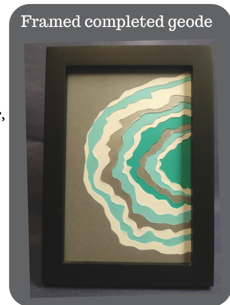
Framed completed geode